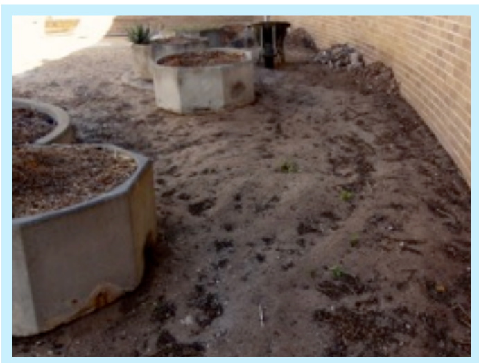
• Beginning of site redevelopment