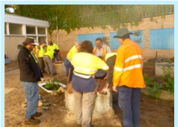
• Working in a team discussing the design of the vegetable garden